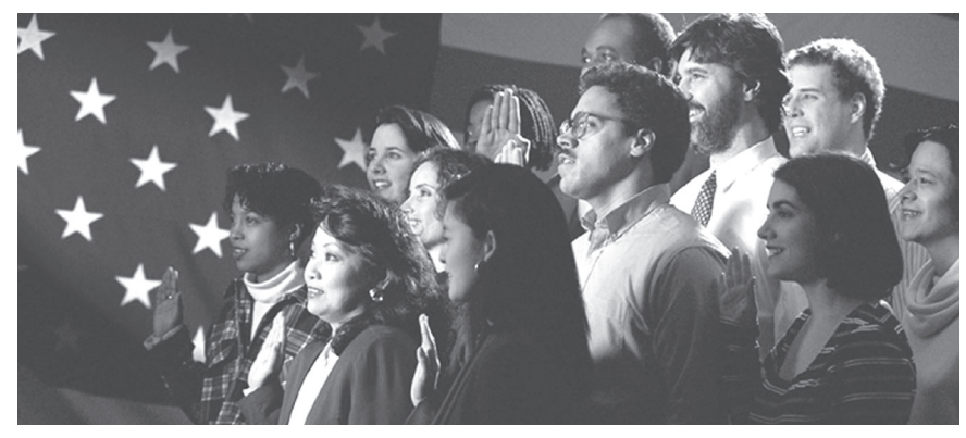
Updated April 2012

This brochure contains general guidelines. In your particular district, procedures might be somewhat different. The judge or jury service personnel at your court will explain any changes in procedures.